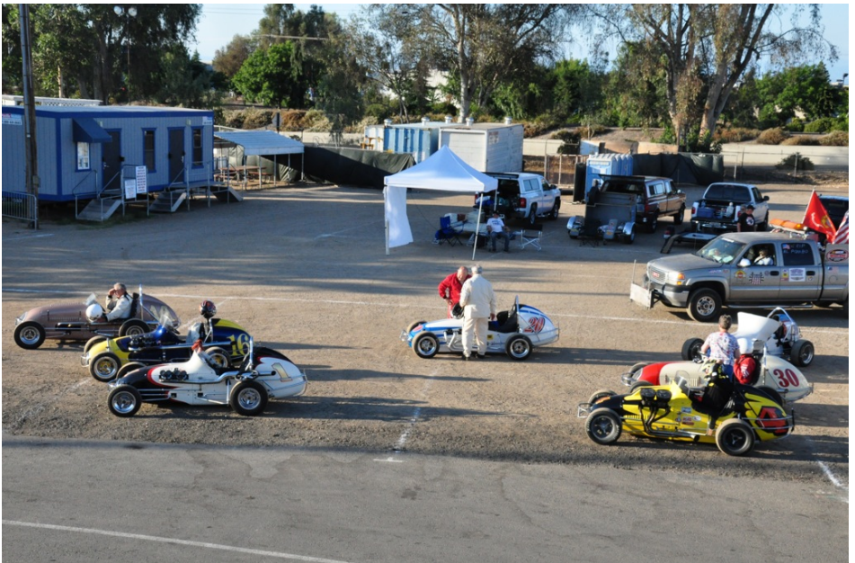
June Wheeler-Ferreira Photo