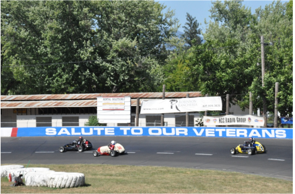
June Wheeler-Ferreira Photo